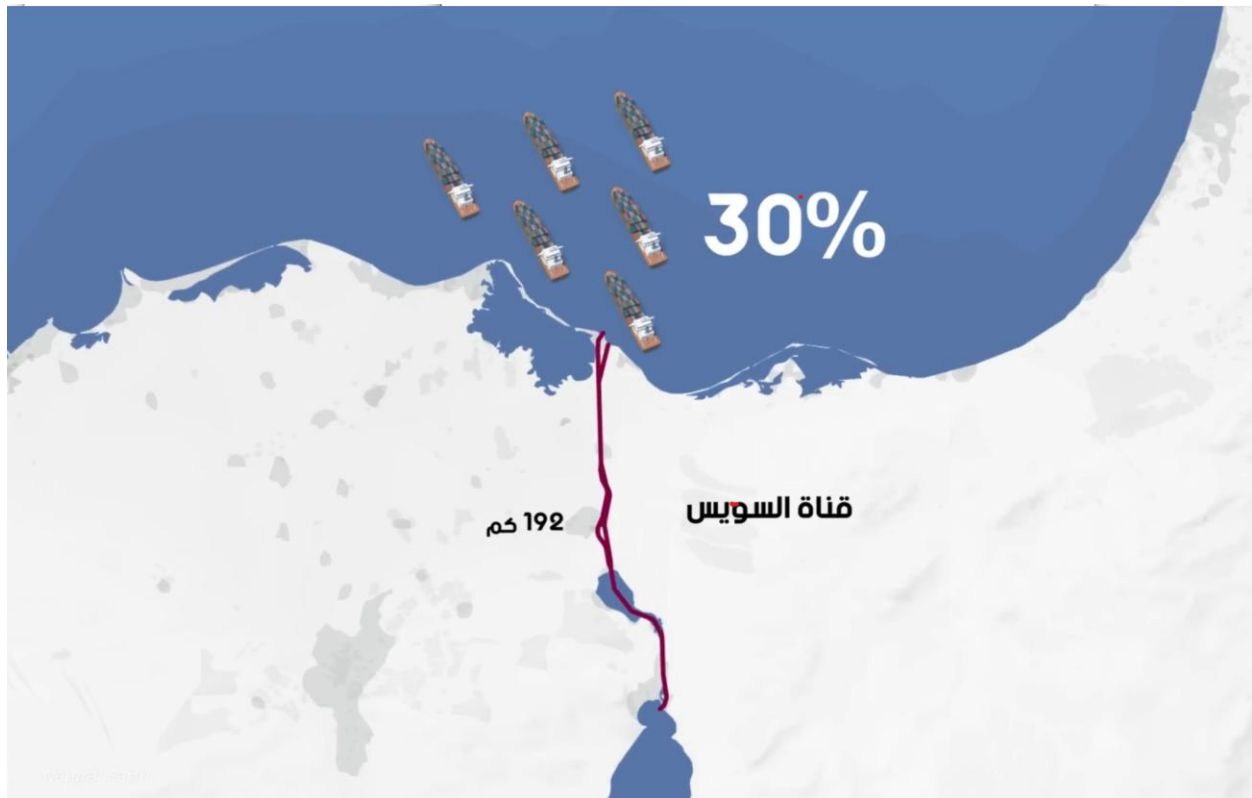
Figure 4: By the author

phenomenon adversely affected rainfall and temperatures worldwide, impacting the Panama Canal's freshwater-based infrastructure. 8