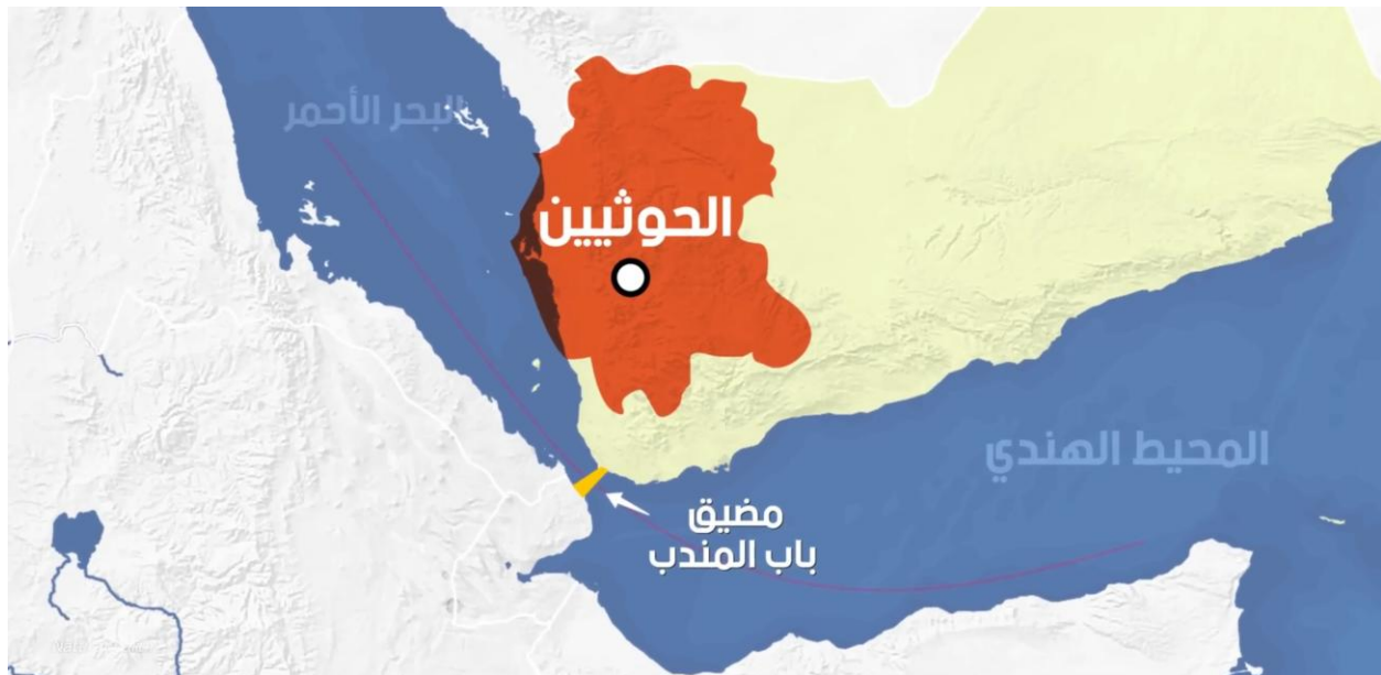
Figure 1:By the author

Examining the map, we discover that the Houthis possess a highly advantageous position due to their proximity to the Bab el Mandeb Strait, a crucial waterway connecting the Indian Ocean to the Red Sea and the Suez Canal. With the strait's narrow width of only 30 kilometers, the Houthis' strategic advantage becomes evident. 2