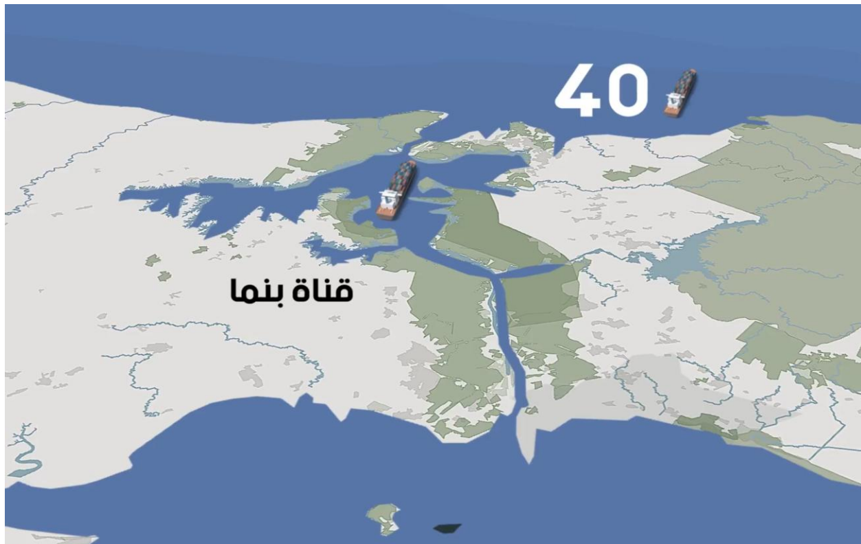
Figure 3: By the author

Compared to its counterpart, the Suez Canal, the Panama Canal offers a five-day reduction in travel time between New York and Shanghai for ships traveling at an average speed. Handling around 5% of global maritime trade, the canal is particularly instrumental in facilitating the transportation of American fuel and grains destined for Asia. Moreover, it serves as the largest source of income for the Panamanian economy, generating $4.3 billion in 2022 alone. 7