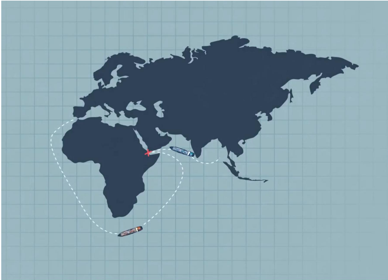
Figure 2: By the author

The Houthi assaults, totaling 24 attacks between November 19 and January 3, have reverberated beyond Israel. The global economy, reliant on smooth international trade, experienced disruptions that surpassed those witnessed during the COVID-19 pandemic. Shipping across oceans constitutes the primary mode of transportation for international trade, with approximately 90% of global trade conducted via sea routes. 4